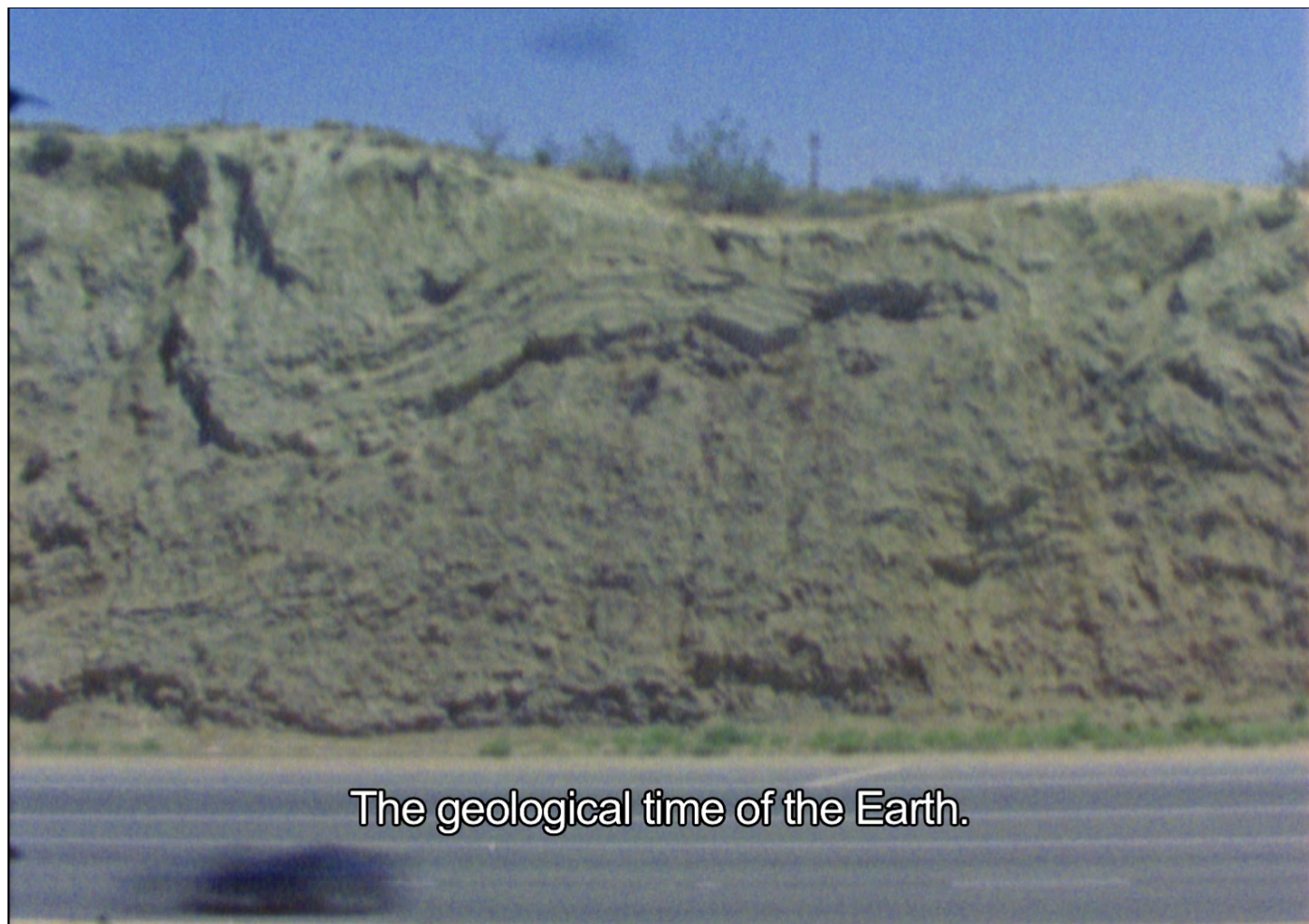
The geological time of the Earth.