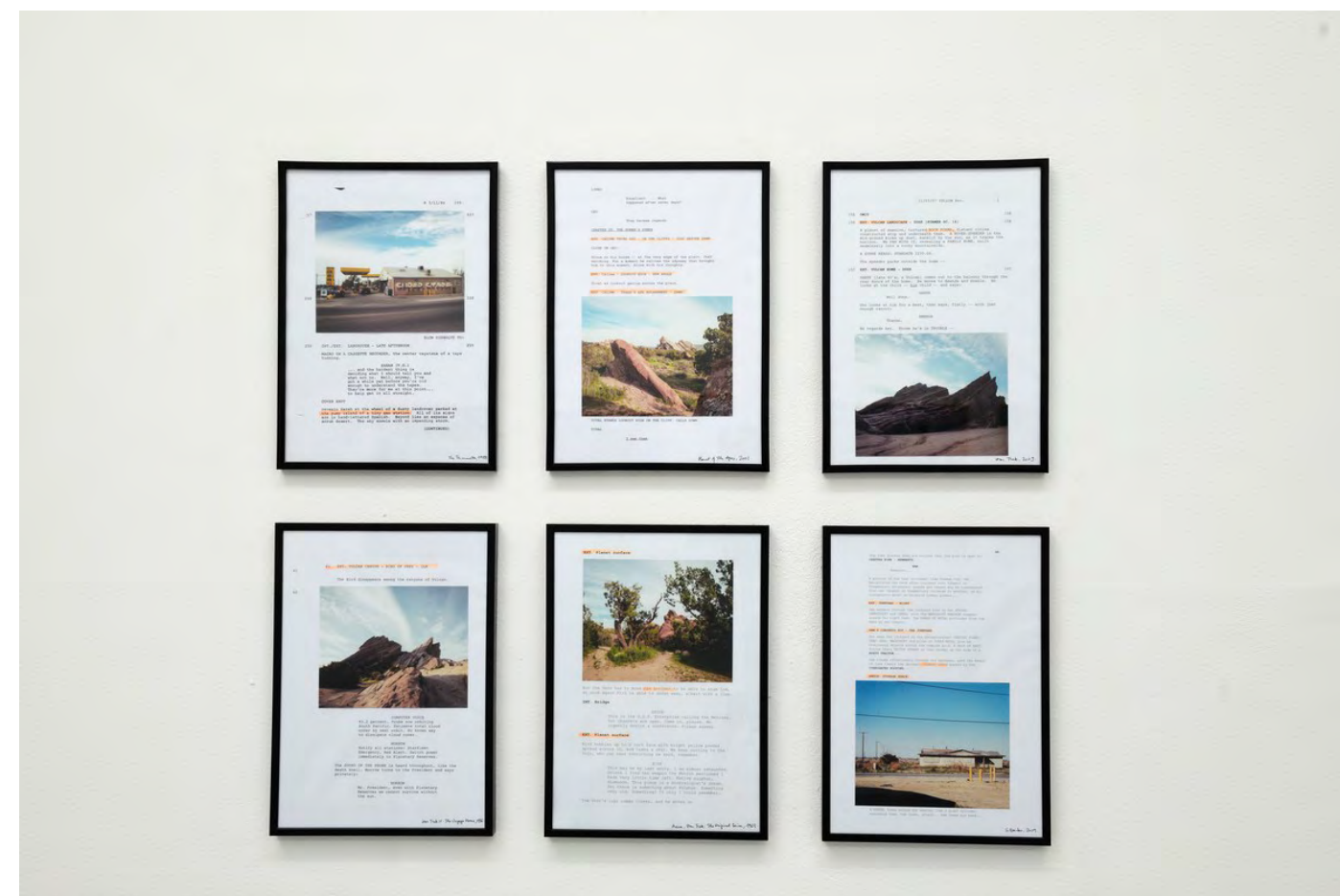
Superposed Locations 6 script excerpts & photographs | 21 x 30 cm | 2015