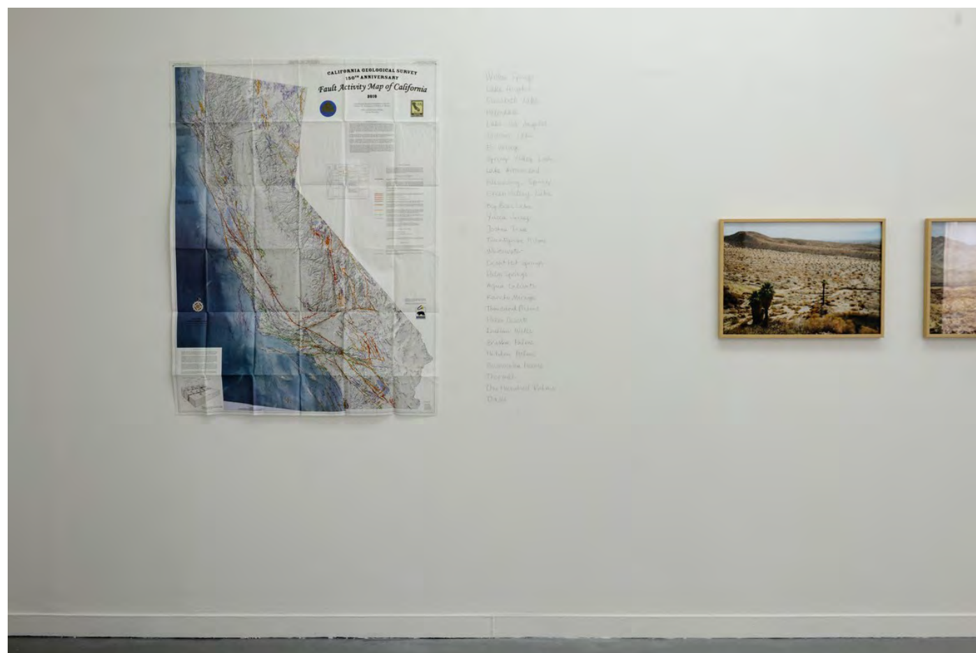
Seismic California geological map & pencil | 120 x 160 cm | 2015